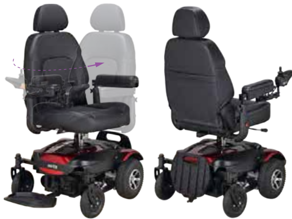
Very easy to convert from rear to front wheel drive: Just release and rotate the chair 180°