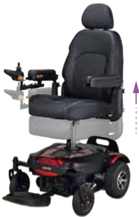
Power seat elevator available. 13cm/5in